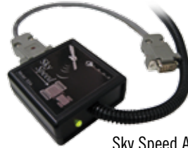
Sky Speed Adapter