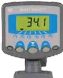
Shaft Speed 6