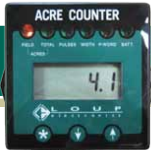
Loupe Acre Counter