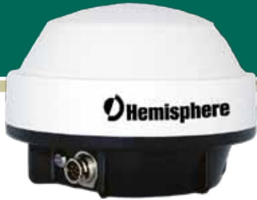
A101 GPS Receiver