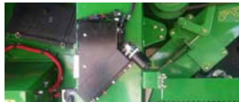
Side Mount Moisture Sensor Installation