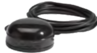
16 HVS Receiver