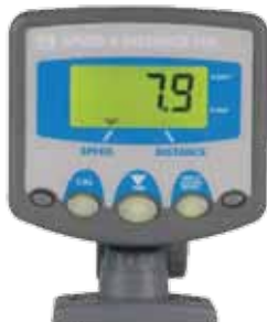
Speed Area Meter