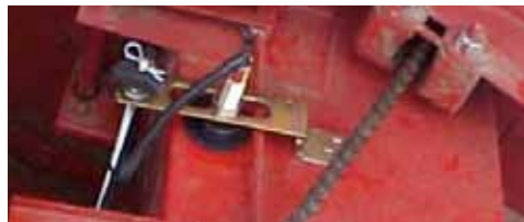
Yield Sensor Installation